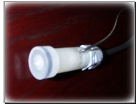
CP200 c/w cable and steel connection

Specific circumstances are not considered within these guidance notes and the user may consult C-Probe for closer analysis of specific situations