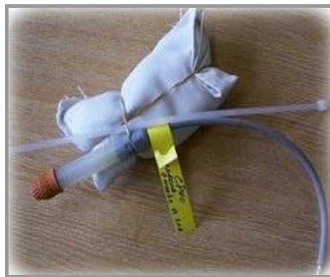
CP40 reference electrode c/w cable and muslin bag ready for shipping.

The CP40 is cylindrical of the dimensions 15mm dia. x 50mm in body length.